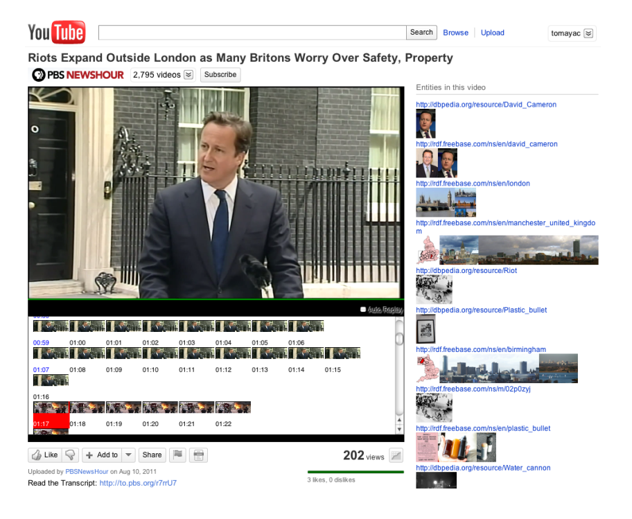
Fig. 2: Screenshot of the YouTube browser extension, showing the three different event types: visual events (video shots below the video), occurrence events (contained named entities and their depiction at the right of the video), and interest-based events (points of interest in the video highlighted with a red background in the bottom left).

Interest-based Event Detection Process As soon as the visual events have been detected, we attach JavaScript event listeners to each of the shots and count clicks on shots as an expression of interest in those shots.