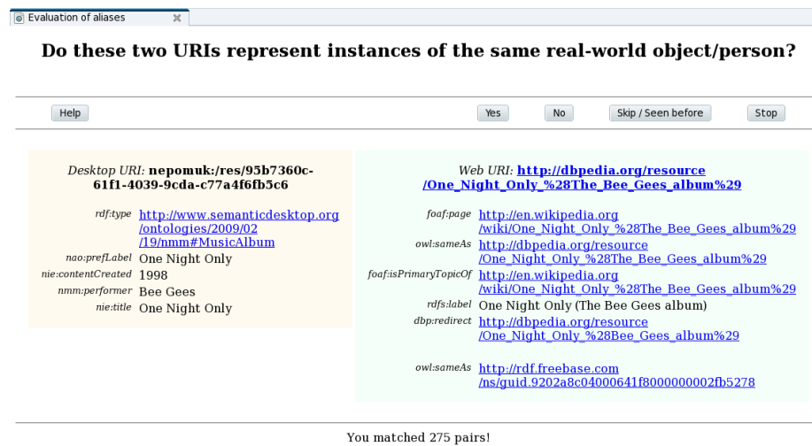
Fig. 3. The web interface of the experiment for collecting relevance judgements.

We collected the relevance judgements from experts through an online experiment, in which we asked participants to decide if pairs of desktop and web URIs identify the same real-world object or person. We evaluated in this way all 3.000 pairs from the two corpora. Each pair was judged by three different experts. Eighteen people participated in the experiment, all researchers in the area of Semantic Web.